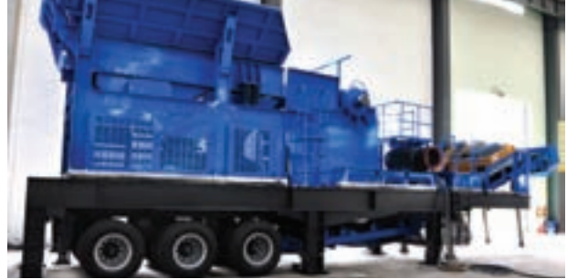
Portable Jaw Crushing Plant