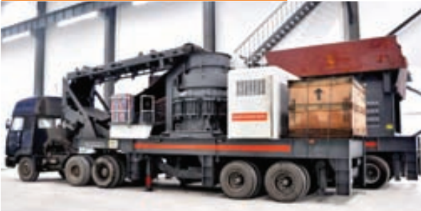
Portable Cone Crushing Plant