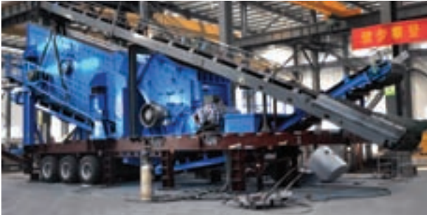
Portable Impact Crushing Plant